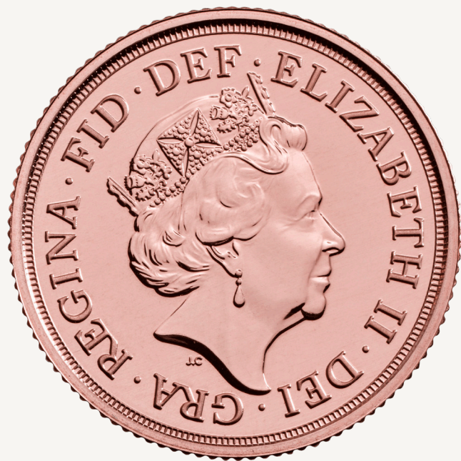
The Sovereign Obverse