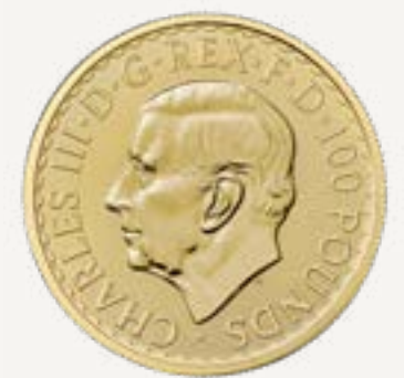
1oz Gold Obverse